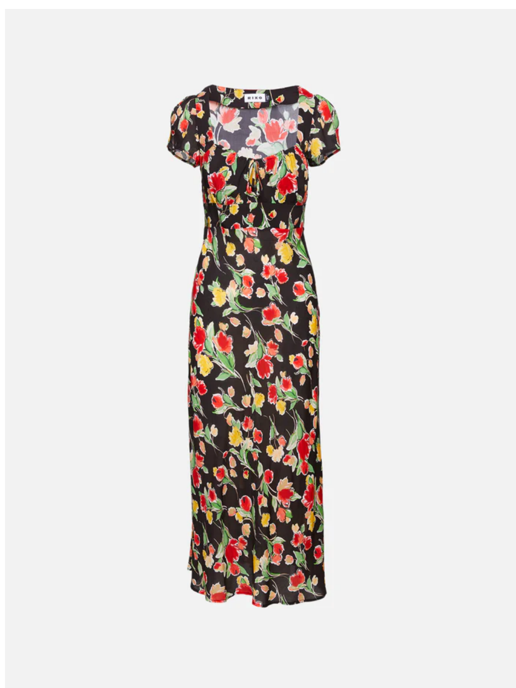
RIXO Marisa Dress $360