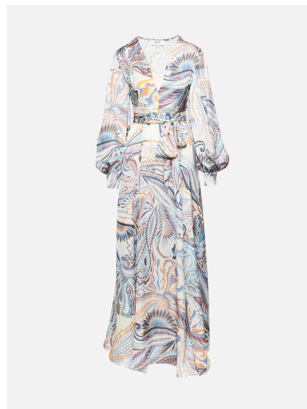
OUD Didi Dress $885