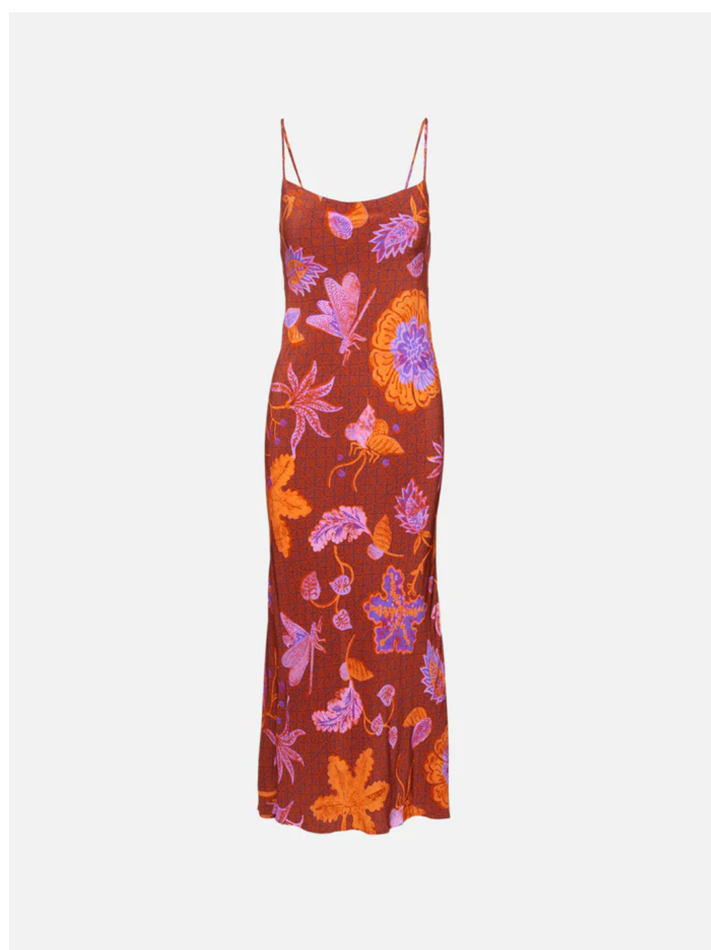
RHODE Jemima Dress $545