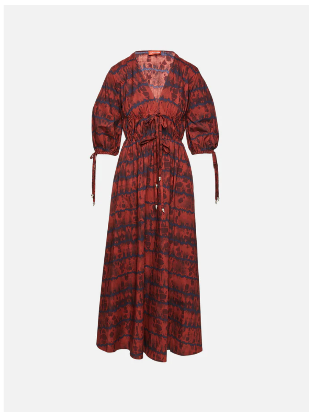
ALTUZARRA Donrine Dress $449 $1,495